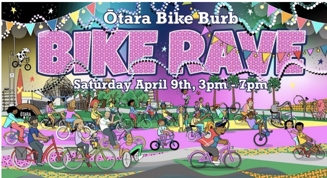
Event flyers: Top Left – Triple Teez Bike Expo; Top Right – Ōtara Bike Burb Koha Fix Day; Bottom – Ōtara Bike Burb Bike Rave